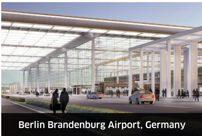
Berlin Brandenburg Airport, Germany