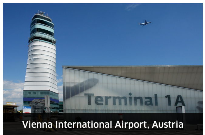
Vienna International Airport, Austria

For suisseplan, the project at Zurich Airport was the cornerstone of a success story which continues to this day.