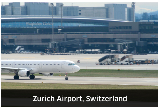
Zurich Airport, Switzerland

We have provided consulting services to airports as suisseplan or as part of an IATA team. We have planned new baggage handling systems, updated and expanded existing ones. We have successfully implemented both simple and highly complex projects. Always on time. Always within budget. And we continue to do so.