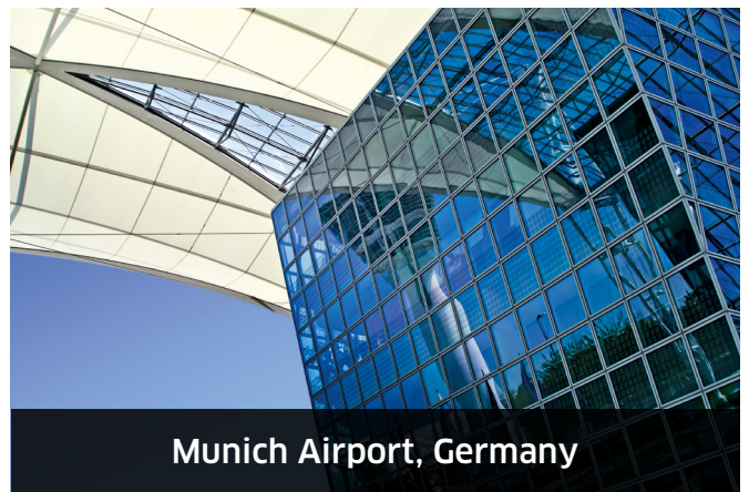
Munich Airport, Germany

suisseplan Ingenieure AG Logistik was contracted by the project manager to provide planning services for the new baggage handling system at Berlin Brandenburg Airport. A compact system with a high capacity per unit area was planned for the greenfield new construction project.